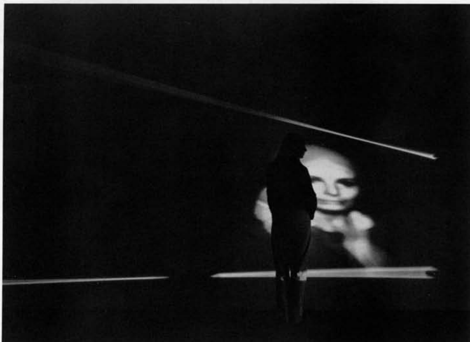
Fig. 3 Peter Campus, Mem , 1975, video installation.

The two video installations—by Peter Campus and Buky Schwartz—explore the closed-circuit, real-time perception of video. Unlike film, which must be processed before it can be screened, the video image is instantaneously recorded and playable. Thus the video camera in the hands of the installation artist can